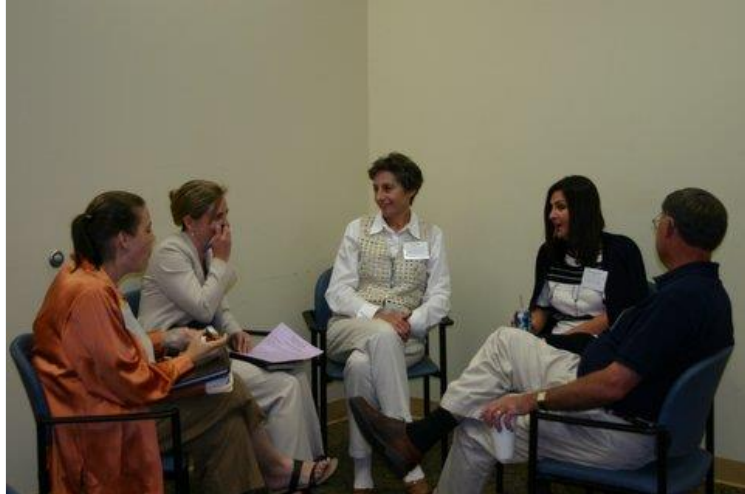
January 23, 2020